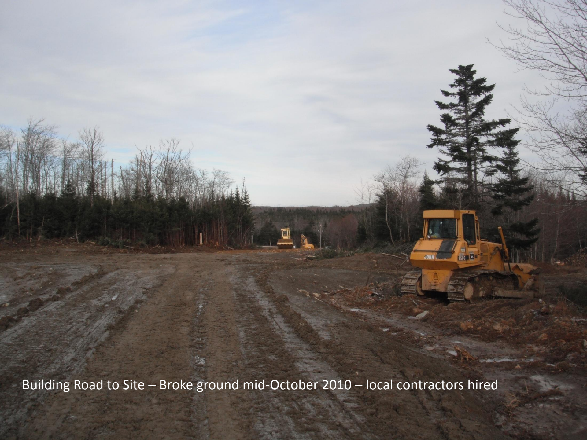
Building Road to Site – Broke ground mid-October 2010 – local contractors hired